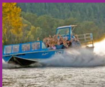
Hellgate Jetboat Excursions