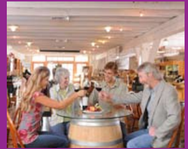
Rogue & Applegate Valley wine tasting