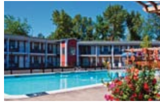
Best Western Horizon Inn

The Ginger Rogers Craterian Theater is the Rogue Valley's premiere live performance venue. Programs include a wide variety of Broadway musicals and stage plays. It's located in the heart of downtown Medford.