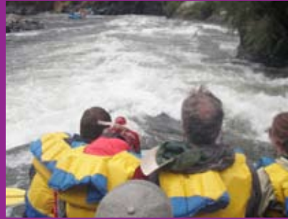
Rafting the Rogue River