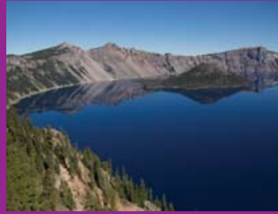
Crater Lake National Park