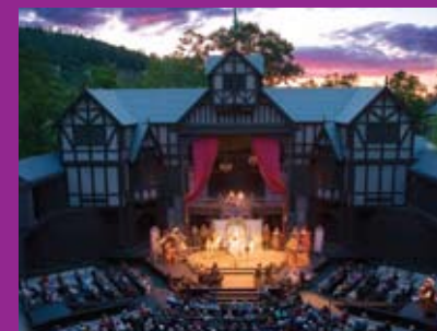
Oregon Shakespeare Festival